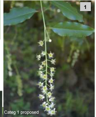
Categ 1 proposed

Members of the rose family, Rosaceae, are prominent. These include: black cherry ( Prunus serotina ) (photo 1), a large tree with cylindrical, pendent inflorescences and small black mature fruits; American dewberry ( Rubus flagellaris ) (photo 2), a trailing shrub with slender stems and very large white flowers; firethorns ( Pyracantha spp.) (photo 3), cotoneasters (photo 4), eglantine rose ( Rosa rubiginosa ) (photo 5). These species reproduce from seed spread by birds and are invading grasslands and forest margins