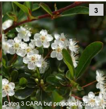
Categ 3 CARA but proposed categ 1