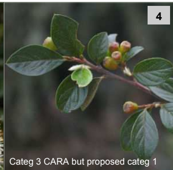
Categ 3 CARA but proposed categ 1