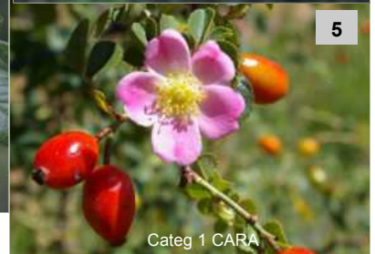
Categ 1 CARA

Willow hakea ( Hakea salicifolia ) (photo 6), commonly cultivated as a hedge or screen plant, invades moist sites. European gorse ( Ulex europaeus ) (photo 7), and Scotch broom ( Cytisus scoparius ) (photo 8), are ornamental shrubs that have long been prohibited under CARA.