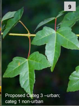
Proposed Categ 3 –urban; categ 1 non-urban