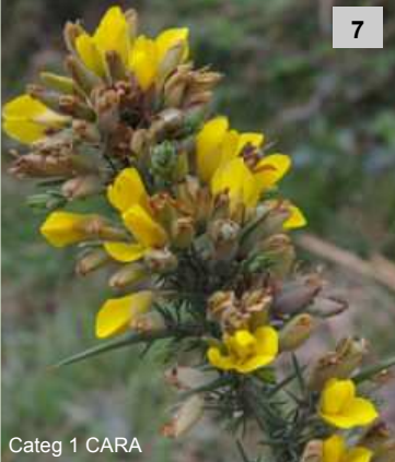
Categ 1 CARA