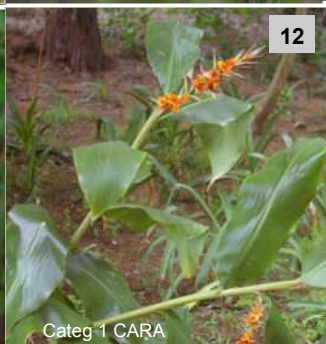
Categ 1 CARA