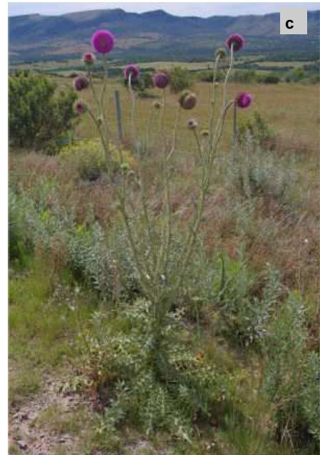
Nodding thistle, Carduus nutans (= C. macrocephalus ), a very prickly, aggressive invader, is a threat to agriculture in the E Cape. Nodding mature inflorescence (photo a), immature inflorescence (photo b) and plant up to 2 m tall (photo c).

Nodding thistle is native to Europe, North Africa and Western Asia. It has become invasive in the USA—where it is a declared noxious weed in 22 states, Canada, Australia and New Zealand. It forms dense stands particularly in disturbed and overgrazed sites; there is some evidence of allelopathy—the chemical inhibition of the growth of other plants, and development of resistance to herbicides. In South Africa this weed appears to be restricted to the Grahamstown, Albany and Alexandria magisterial districts. It is adapted to a wide range of environmental conditions and has the potential to greatly expand its distribution. Please send records of this invader to Lesley Henderson.