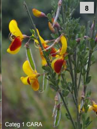
Categ 1 CARA