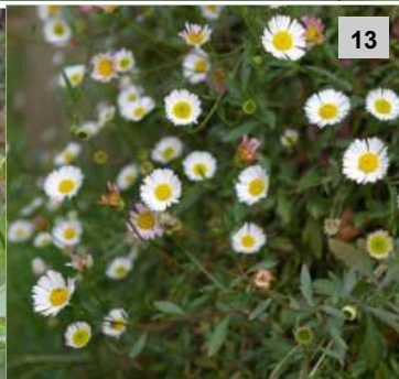
Categ 3 proposed