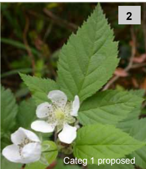
Categ 1 proposed