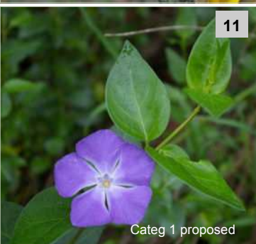
Categ 1 proposed